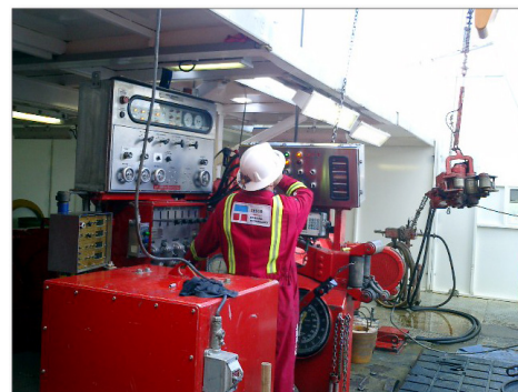
A top-drive technician tests the Slider equipment soon after installation on a land rig working for Anadarko in Canada.

Significant well-cost savings such as the Slider technology provides thus offers another research opportunity to enhance the Nation's energy security.